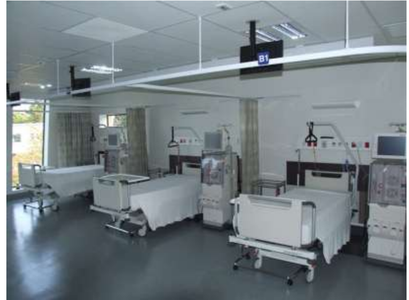
Renal Dialysis – North Shore Hospital

Our core values: Customer Focus 'eye' | Integrity 'sunrise' | Compassion 'bird' | Respect 'koru' | Openness 'flower'