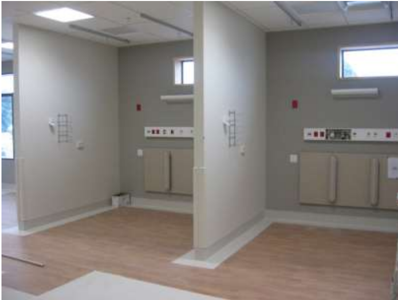
Lakeview Emergency Centre and Cardio – North Shore Hospital